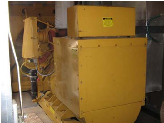
Verizon Wireless needed a mobile solution for emergency power generation. This picture shows the generator.