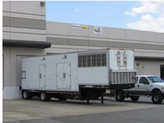
Teledon designed the conversion plans, and implemented them. The converted generator was delivered to the customer on a mobile platform. The design included a trailer mounted load bank for exercising the generator

The customer, Level 3 Communications, needed enclosure solutions for their satellite control systems. Teledon designed, built, and integrated their control systems into a standardized selection of wall mount solutions.