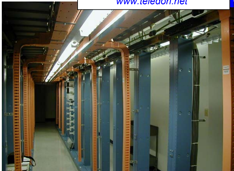
Completed line up of frames, light guide trays, and AC lighting