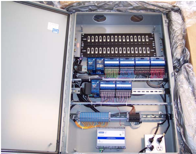
The customer was able to reclaim valuable rack space by moving their controls from a rack mount to a wall mount setup.

The customer, Level 3 Communications, needed enclosure solutions for their satellite control systems. Teledon designed, built, and integrated their control systems into a standardized selection of wall mount solutions.