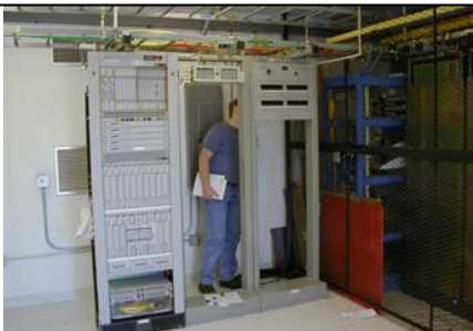
Teledon Quality Auditor verifying that our work meets our customer's quality standards

Our customers have cited our efficiency and our daily progress reports in the deployment & support of telecom networks as strong values we bring to the table.