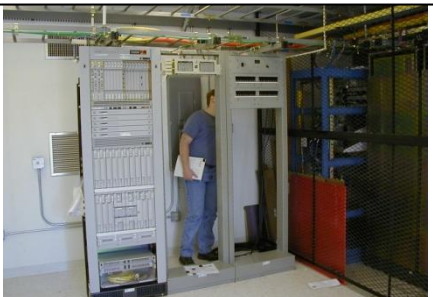
Teledon Quality Auditor verifying that our work meets quality requirements

Our customers have cited our efficiency in the deployment & support of their telecom & IT networks, and our daily progress reports as strong values we bring to the table.