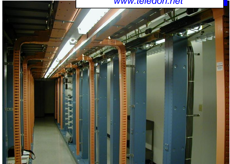
Completed line up of frames, light guide trays, and AC lighting